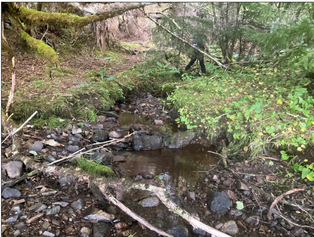
Figure 2.—Channel at waypoint 1466.