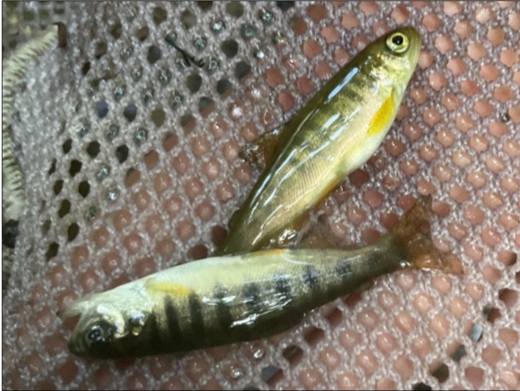
Figure 1.—Juvenile coho salmon captured at waypoint 1466.